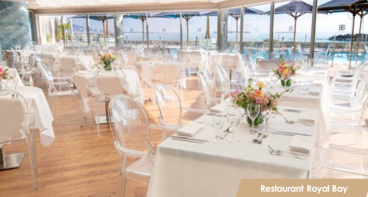
Restaurant Royal Bay